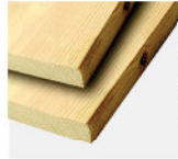
Timber fiber-cement board.