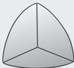
^ ART. 115

Supply and install ITALPROFILI® inside and outside corners or similar, made of UV stabilized PVC-P.